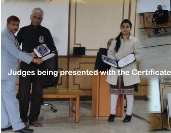
Judges being presented with the Certificate