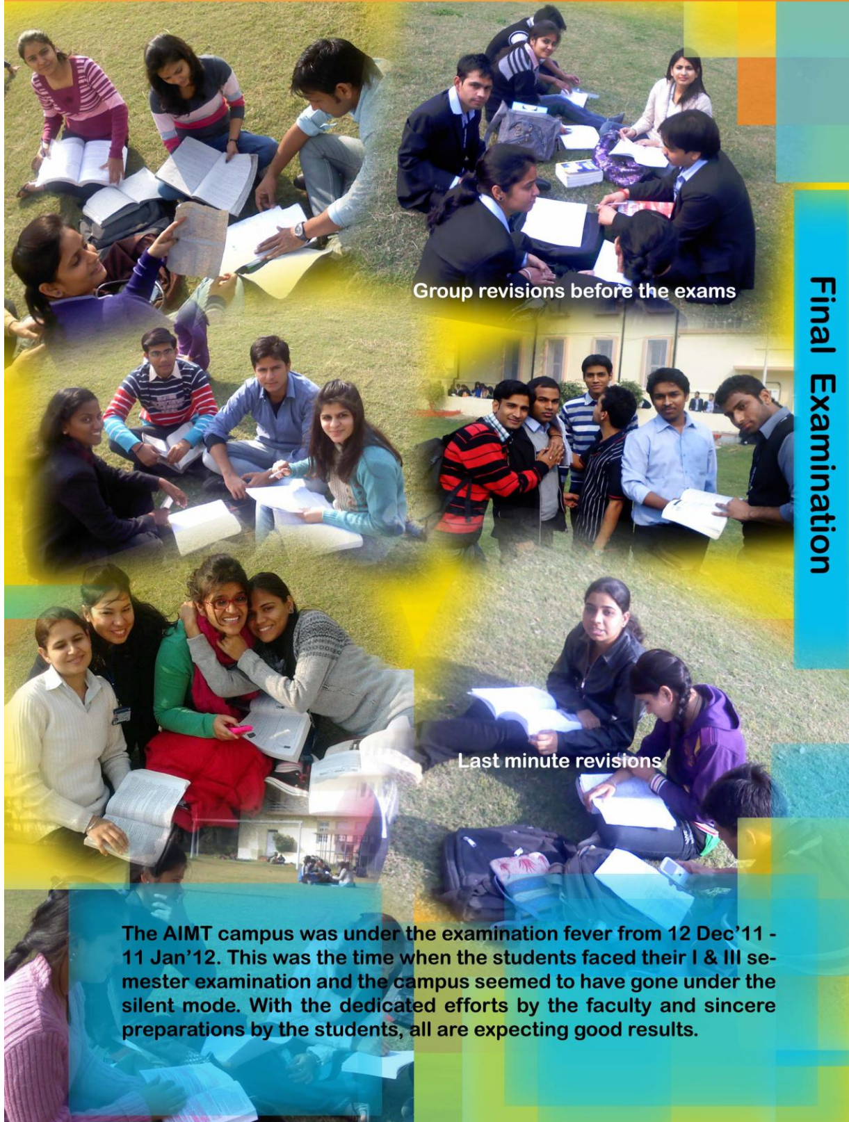
Group revisions before the exams