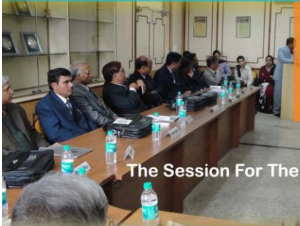
The Session For The Judges

The journey continues for the MDP @ AIMT. The week long residential program for the Judicial Officers of UP was in full swing during the month of January 2012.